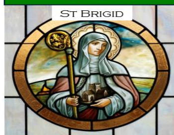
1 st February