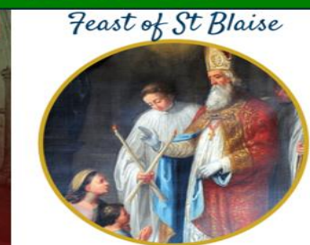
3 rd February

This year also celebrates 1500 th Anniversary of the Life and Ministry of St Brigid. We are one of only seven Churches in the Archdiocese to have a Church dedicated to St Brigid and so it seems fitting that we should ensure celebrations take place throughout this year in the Parish highlighting the Ministry of St Brigid. Please keep close attention to our bulletin over the coming weeks.